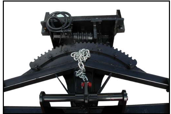
PRWG MOTOR / WORM GEAR

Hydraulic orbital motor direct couples to a hardened worm gear at the “A” frame. The worm, in turn, meshes with a gear segment at the rear of the reversing circle to provide a mechanism which produces a mechanical advantage of 105 to 1. Whenever you release the reversing control lever the moldboard automatically holds position where it is. Gone are bent piston rods, leaking seals and damaged lock mechanisms. MOST IMPORTANT OF ALL: HERE IS THE ABILITY TO POWER REVERSE WHILE PLOWING ON THE MOVE. Mechanism reverses the plow up to 35° right or left of the bulldoze position.